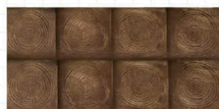
Model:A12506 Color NO.6 年轮古木