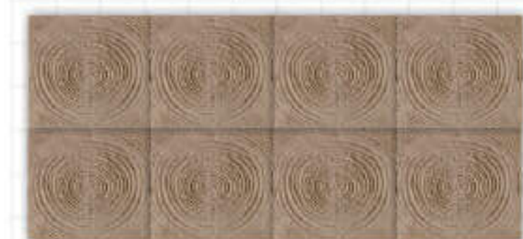
Model:A12506 Size:1200x600x15mm Color NO.1 星空黑