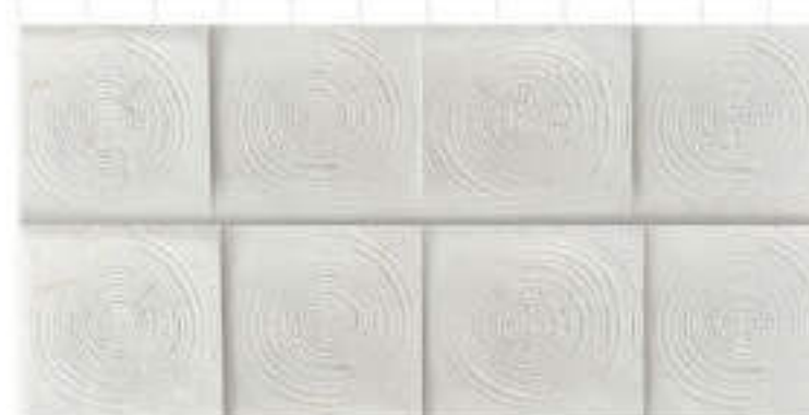
Model:A12506 Color NO.4 汉白玉