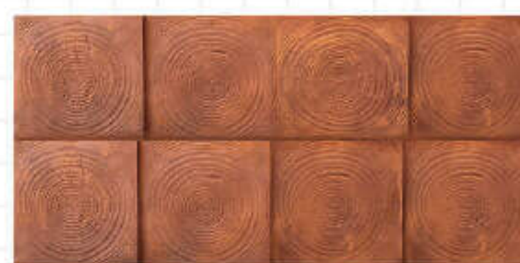
Model:A12506 Color NO.5 仿古橙