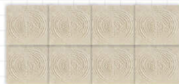
Model:A12506 Color NO.3 汉白玉