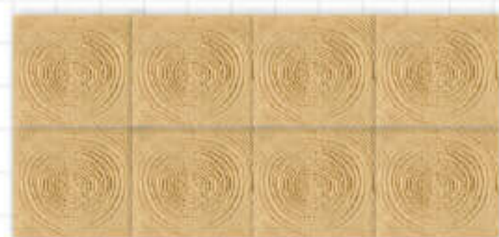
Model:A12506 Color NO.2 咖啡棕